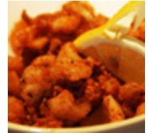
IKA PIRI KARA AGE