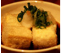
AGE DASHI TOFU