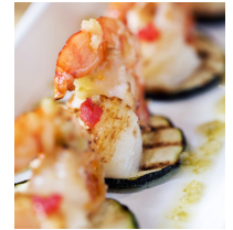
PRAWN & SCALLOP